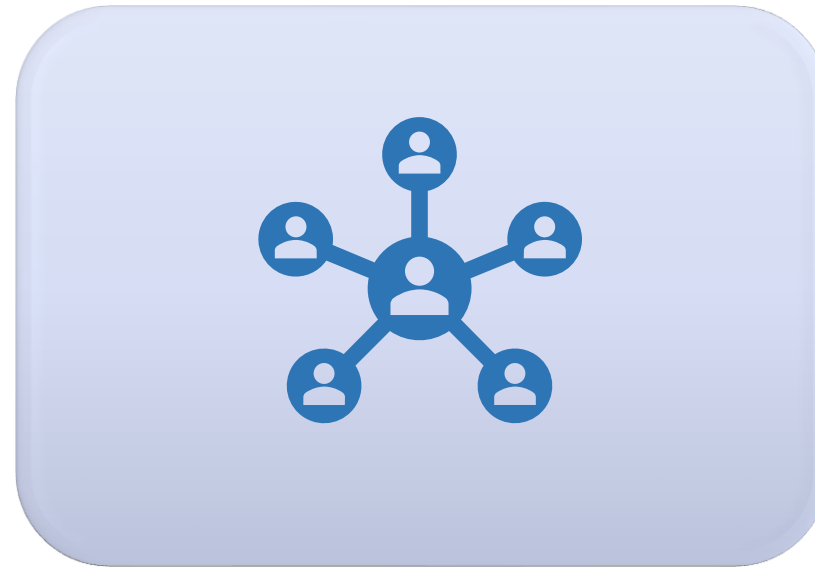
Small Business Tech Consortium