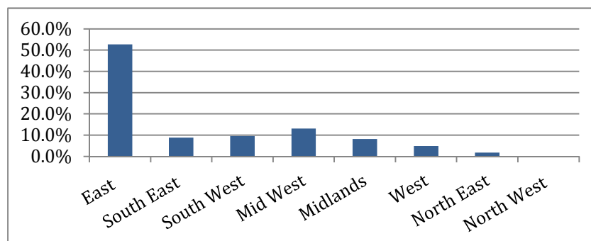
Figure 1 Percentage of CGS Lending Sanctioned by Region (Monetary Value)