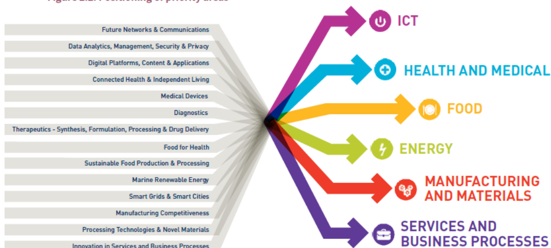
Figure 2.2: Positioning of priority areas

The current cycle of RP runs for the five-year period 2013 to 2017. While the rationale for focusing investment to support the enterprise sector will remain valid beyond this period, the specific areas of focus will need to be reviewed and refreshed in the light of changed circumstances.