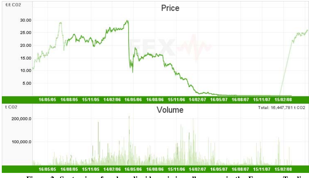
Figure 2: Spot price of carbon dioxide emission allowances in the European Trading System – from <u>www.eex.com</u>

One could use current market price or the average over a recent period to price carbon emissions. This measure is simple and transparent, but as the ETS is a spot market, it does not take expectations of the future into account. We will therefore need some other method for obtaining values for the seven- to ten-year term of a project evaluation.