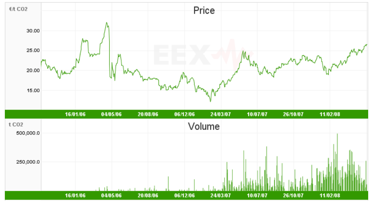
Figure 3: Derivatives price (Second Period European Carbon Futures – 2008) – from <u>www.eex.com</u>