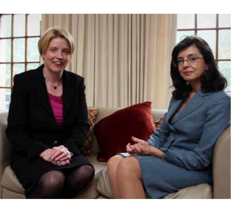
An Tánaiste and Minister for Enterprise, Trade and Employment, Mary Coughlan, T.D., and Meglena Kuneva, EU Consumer Commissioner, discussing issues relating to consumer affairs.

The Department responded to an invitation from the EU Commission to make submissions on its White Paper on Damages Actions for breach of the EC anti-trust rules. The White Paper contained a number of proposals designed to tackle obstacles to private enforcement of competition law and the difficulties involved in bringing damages claims.