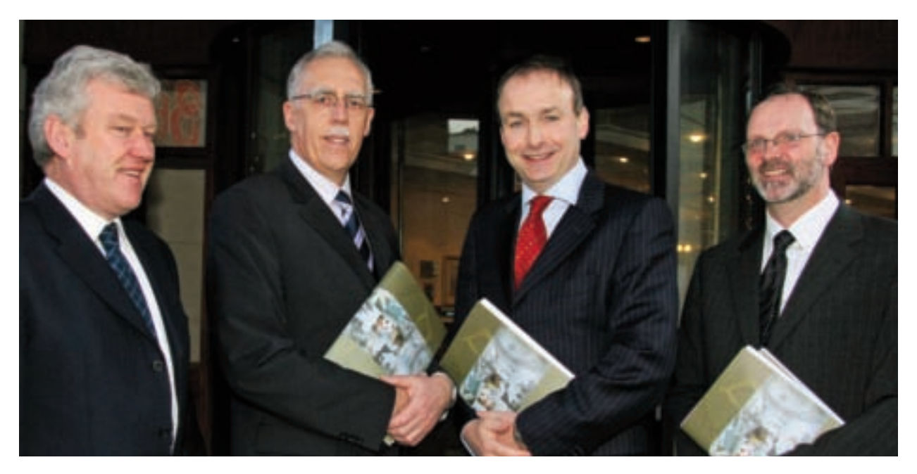
Minister Martin at Launch of New Employment Permit Arrangement: Sean Gorman-Secretary General DETE, Minister Killeen-Minister for Labour Affairs, Minister Martin-Minister for Enterprise, Trade and Employment and Dermot Mulligan-Assistant Secretary Labour Force Development.

is also strongly linked to enterprise development, with the Green Card Scheme in particular allowing us to attract the highly skilled people we need to move our economy to a new level – one which will generate high-value jobs into the future. During its first year of operation a total of 2,794 permits issued under the Green Card Scheme.